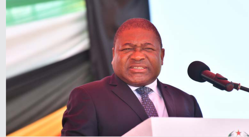
H.E. Mr. Filipe Jacinto Nyusi, President of the Republic of Mozambique giving his remarks during the launch of SAMIM

6. This event is a significant milestone towards addressing some of the obstacles to our aspirations to achieve regional integration and socio-economic development.