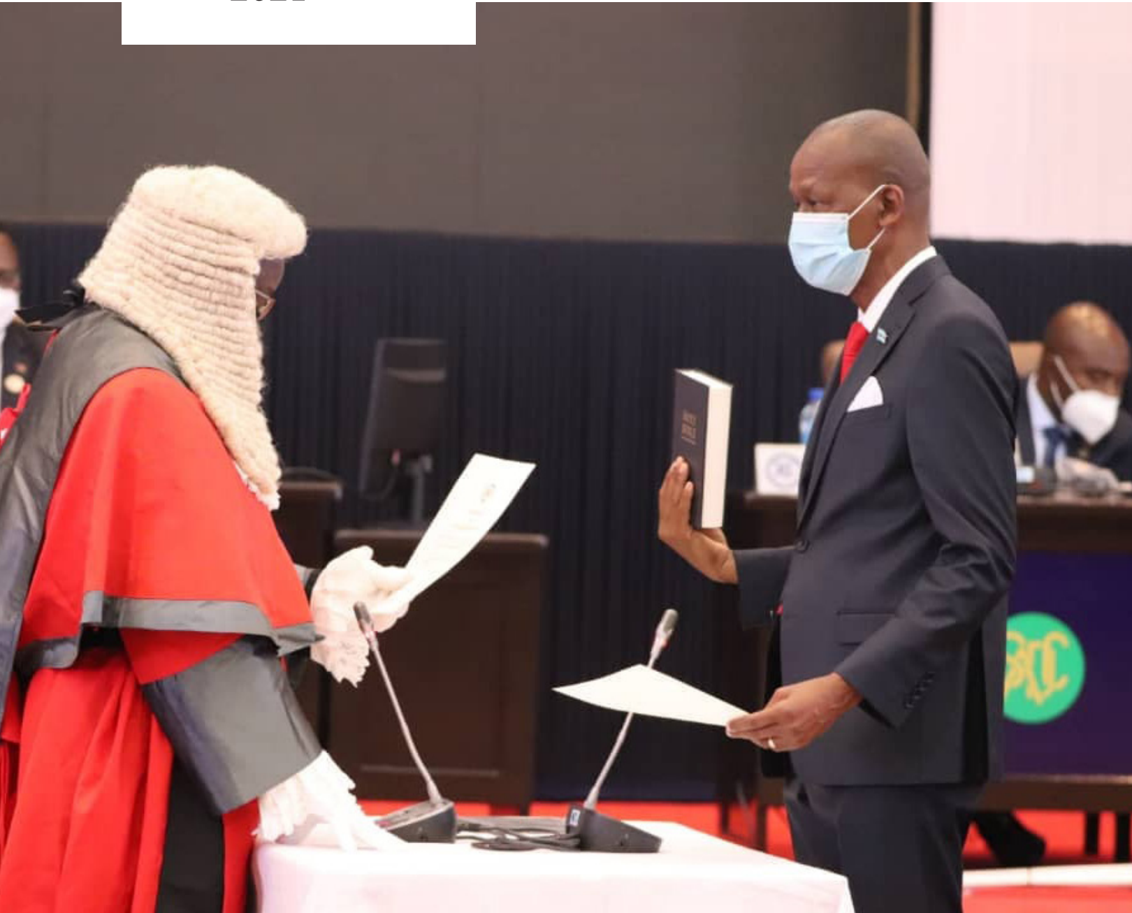
H.E Mr. Elias Mpedi Magosi being sworn as the new Executive Secretary of SADC on 18 th August 2021, Lilongwe, Malawi

To lead a SADC Secretariat that is fully accountable to the Member States towards the realisation of regional integration and industrialisation within a secure and assuring environment, guided by strong governance principles and a fulfilled and high performing workforce.