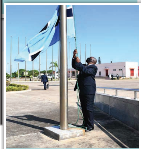
Botswana flag being raised during the Launch of SAMIM