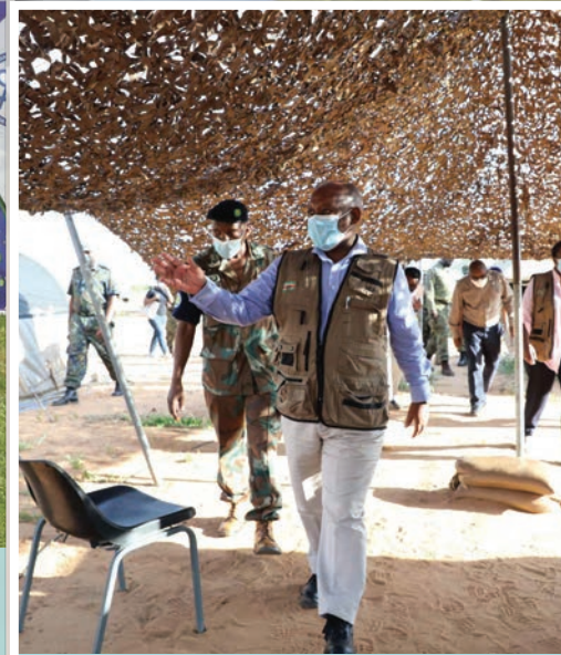
Honourable Mr. Kagiso Mmusi, Minister of Defence, Justice and Security in Pemba, Mozambique