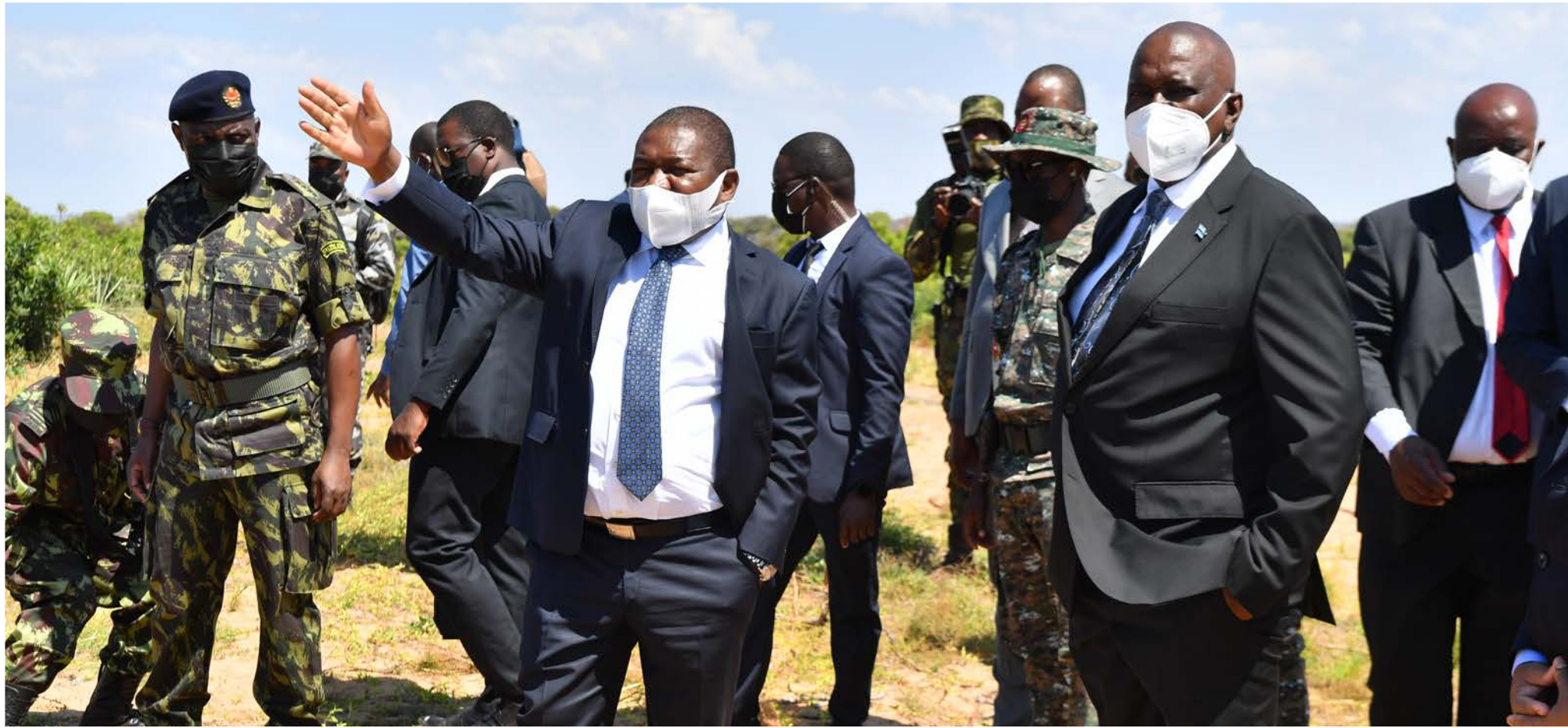
H.E Dr. Mokgweetsi Eric Keabetswe Masisi with H.E Mr. Filipe Jacinto Nyusi during their visit to Pemba, Mozambique

The deployment of this Mission is in line with the principle of subsidiarity, as encapsulated in the Constitutive Act of the African Union. It is also premised on the United Nations Charter to restore international peace and security.