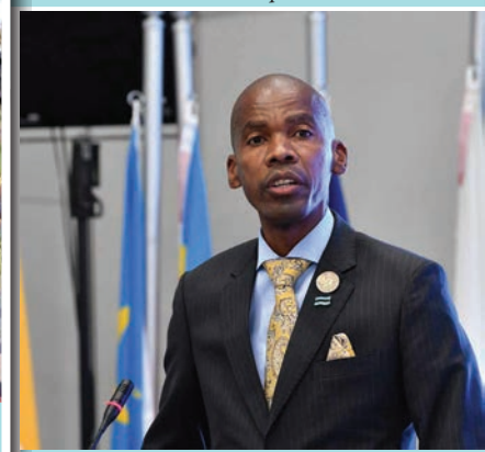
Minister of International Affairs and Cooperation, Dr. Lemogang Kwape giving his remarks during a SADC meeting