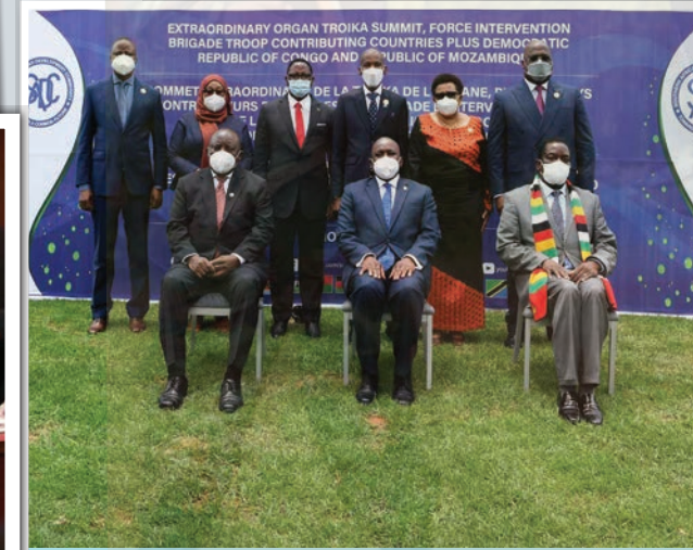
His Excellency Dr. Mokgweetsi Eric Keabetswe Masi with his counterparts during the SADC Extraordinary Organ Troika Summit on 18 th August 2020