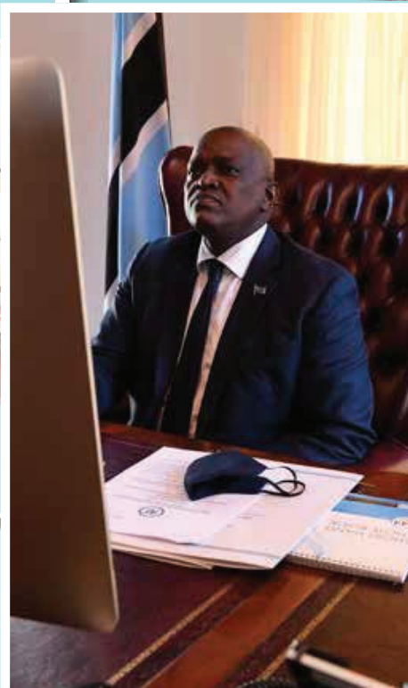
His Excellency President Dr. Mokgweetsi Eric Keabetswe Masi participating in a virtual Organ Troika Summit