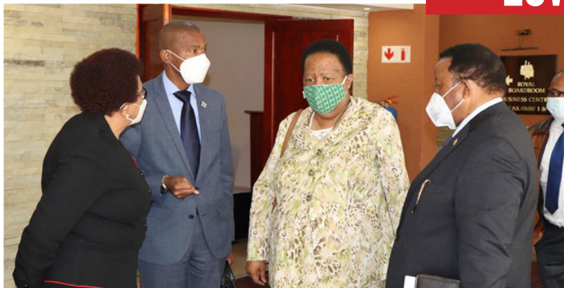
Organ Troika Ministerial fact finding team in the Kingdom of Eswatini, July 2021