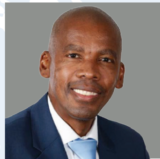
HON. DR. LEMOGANG KWAPE MINISTER OF INTERNATIONAL AFFAIRS AND COOPERATION