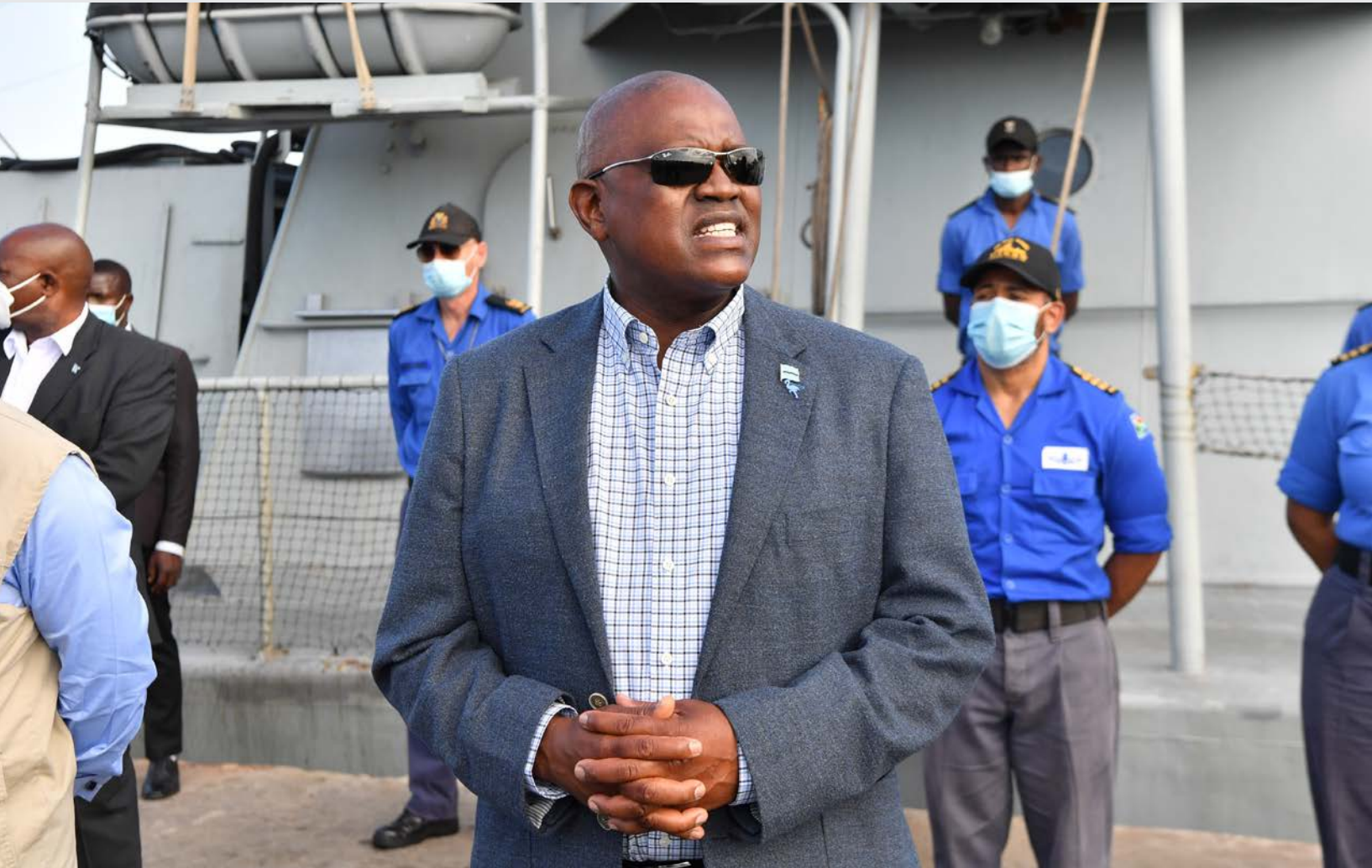
H.E. Dr. Mokgweetsi Eric Keabetswe Masisi, President of the Republic of Botswana, in Pemba, Mozambique