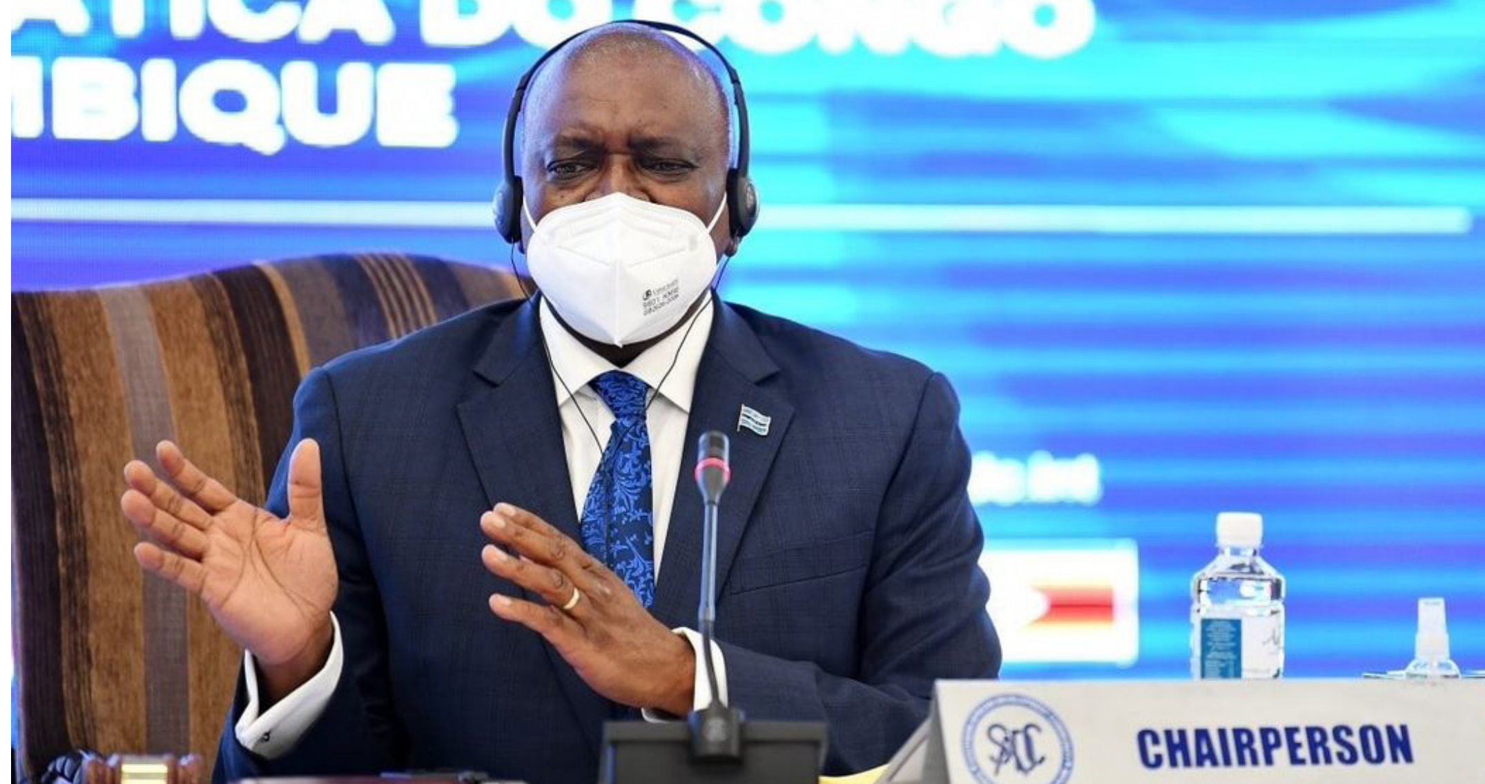
His Excellency Dr. Mokgweetsi Eric Keabetswe Masisi, Chairperson of SADC Organ on Politics, Defence and Security (August 2020 - August 2021) chairing SADC Organ meeting.