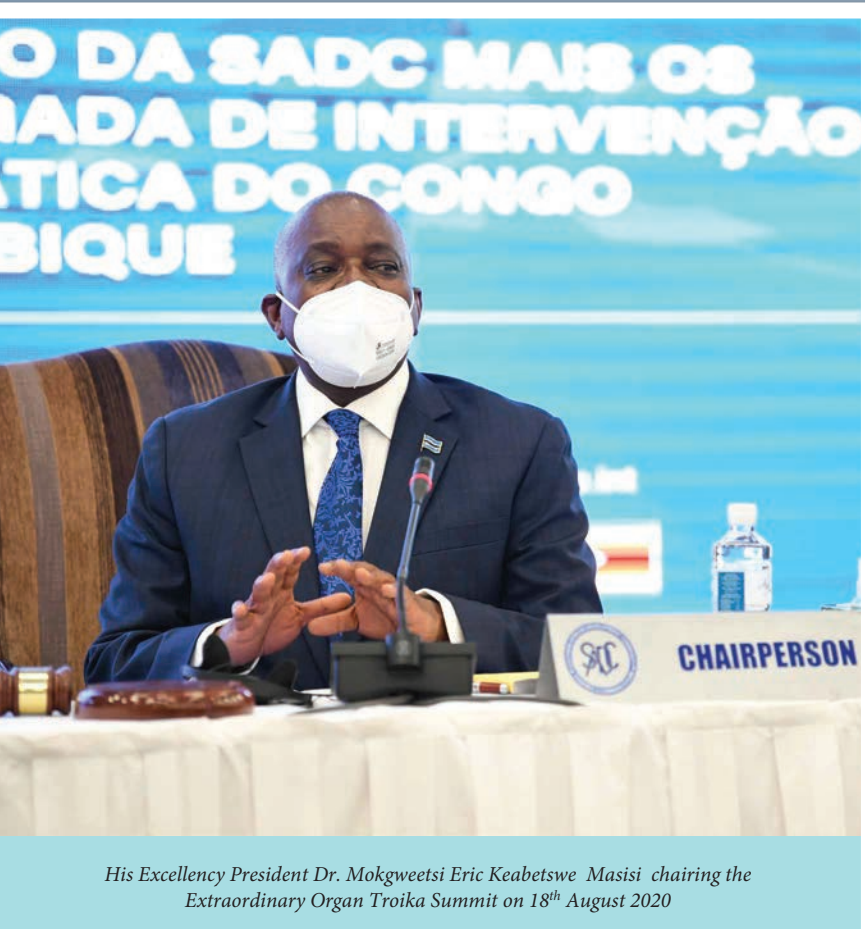
His Excellency President Dr. Mokgweetsi Eric Keabetswe Masi chairing the Extraordinary Organ Troika Summit on 18 th August 2020