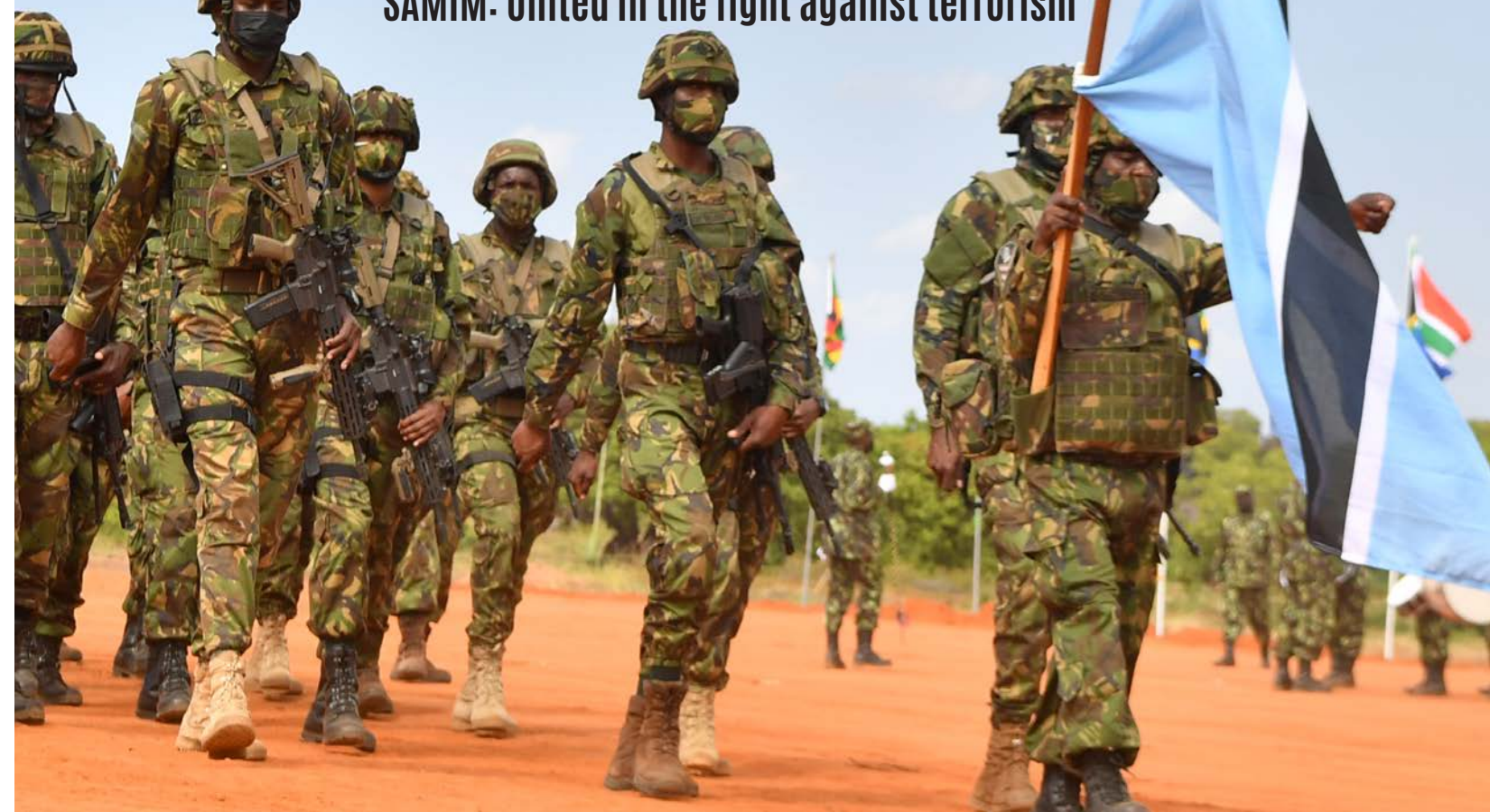
Botswana troops during the launch of SAMIM

SAMIM: United in the fight against terrorism