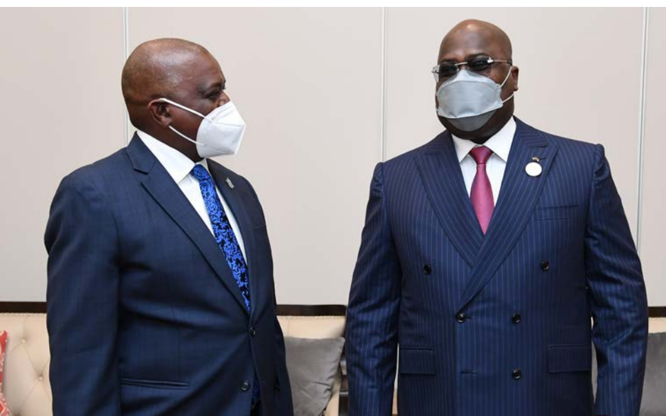
His Excellency Dr. Mokgweetsi Eric Keabetswe Masisi with the President of the Democratic Republic of Congo (DRC), His Excellency Mr. Félix Antoine Tshisekedi Tshilombo.

B otswana assumed the Chair of the Organ at the peak of negotiations between SADC and the United Nations, regarding the reconfiguration of the Force Intervention Brigade (FIB), which is the offensive arm of the UN Stabilisation Mission in the DRC (MONUSCO). The FIB was initially constituted by SADC countries, represented by Malawi, South Africa and the United Republic of Tanzania. In preparation for the impending withdrawal of UN troops from the DRC in 2022, the UN had proposed that the FIB be reconfigured by repatriating some FIB battalions from the SADC Troop Contributing Countries to create space for the inclusion of Quick Reaction Forces from non-SADC countries. The UN also proposed to overhaul and reconfigure the FIB Headquarters by staffing it with non-SADC officers.