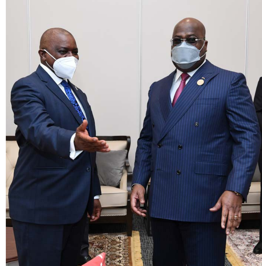
His Excellency Dr. Mokgweetsi Eric Keabetswe Masi as Chairperson of SADC Organ on Politics, Defence and Security holding a bilateral meeting with the President of the Democratic Republic of Congo (DRC), His Excellency Mr. Félix Antoine Tshisekedi Tshilombo on the margins of the Extraordinary SADC Troika Summit on 27 th November 2020

managed to have comprehensive engagement with the Government. It also held a brief meeting with some other stakeholders, which included civil society organisations, political groups and faith-based organisations, basically to assure them that a second Mission to the country will be urgently arranged in order to have further consultations with all the other key stakeholders.