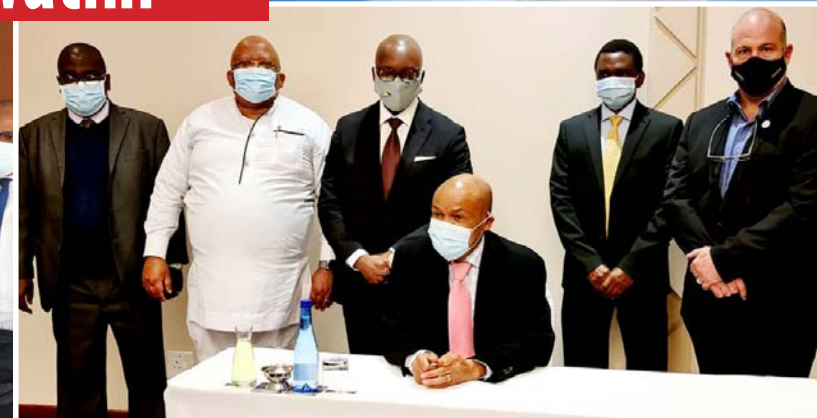
SADC Technical team in the Kingdom of Eswatini, July 2021

F ollowing the political and security disturbances in the Kingdom of Eswatini, at the end of June 2021, as Chair of the Organ, His Excellency the President urgently dispatched an Organ Troika Ministerial Fact-Finding Mission to the Kingdom of Eswatini, on 4 th July 2021. The Ministerial Mission was constituted by the Ministers of Foreign Affairs of Botswana, South Africa and Zimbabwe. It was led by the Minister of International Affairs and Cooperation, Dr. Lemogang Kwape, who was also Chairperson of the SADC Ministerial Committee of the Organ.