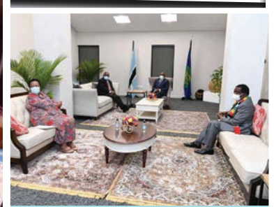
His Excellency President Dr. Mokgweetsi Eric Keabetswe Masi with His Excellency Mr. Cyril Ramaphosa, His Excellency Mr. Emmerson D. Mnangagwa and accompanied by Minister of International Relations and Cooperation (DIRCO) Dr. Grace N. Pandor