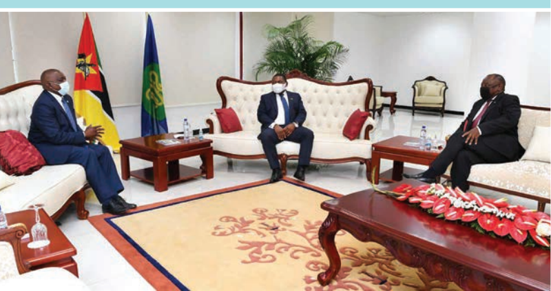
His Excellency President Dr. Mokgweetsi Eric Keabetswe Masi with his counterparts (center) his Excellency Filipe Jacinto Nyusi, President of the Republic of Mozambique and His Excellency Cyril Ramaphosa, President of the Republic of South Africa on 18 th August 2020