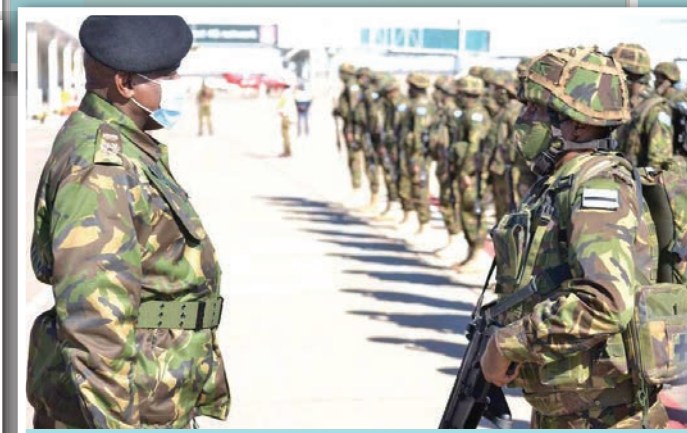
His Excellency President Dr. Mokgweetsi Eric Keabetswe Masi bidding farewell to Botswana Defence Force (BDF) troops who deployed to Mozambique to take part in the Southern African Development Community (SADC) Standby Force Mission on 26 th July 2021