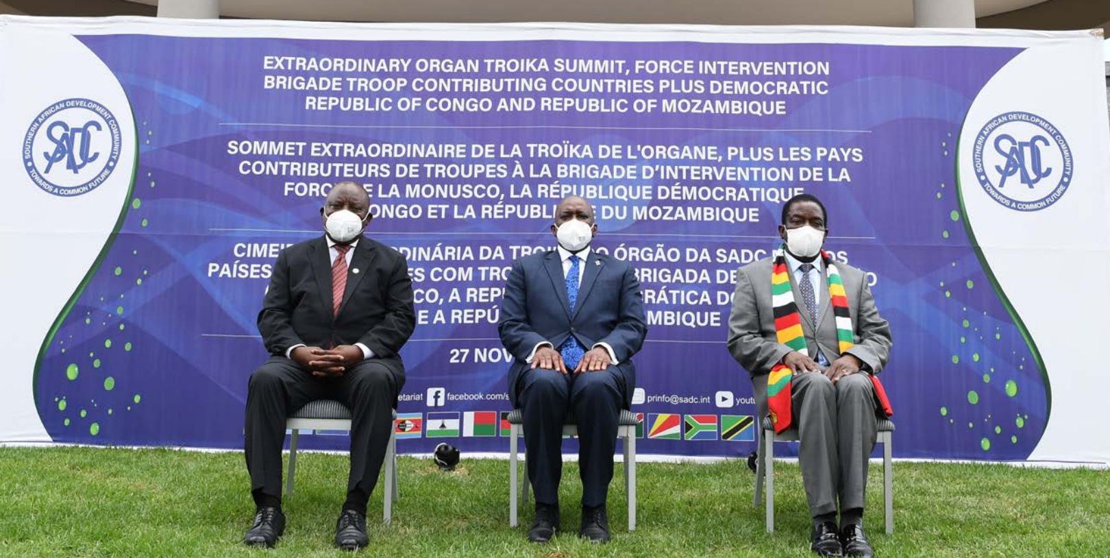
His Excellency Dr. Mokgweetsi Eric Keabetswe Masi as Chairperson of SADC Organ on Politics, Defence and Security with His Excellency Mr. Cyril Ramaphosa, President of the Republic of South Africa as an incoming Chairperson of the Organ and His Excellency Dr. Emmerson Dambudzo Mnangagwa, President of Republic of Zimbabwe as the outgoing Chairperson of the Organ during the Extraordinary Organ Troika Summit held in Botswana on 27 th November 2020

are on board on the regional thinking. As you know, these issues always require face to face discussions due to their sensitivity.